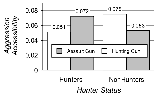
Fig. 2. Aggression accessibility scores as a function of hunter status and type of gun prime; Experiment 2. For each participant, aggression accessibility scores were calculated using log-transformed reaction time data by subtracting the average reaction time to aggressive target words from the average reaction time to anti-aggressive target words. Thus, higher scores indicate relatively greater accessibility of aggressive thoughts.

Experiment 2 demonstrated that people whose experiences with guns differed have different associations in memory to identical gun stimuli. Specifically, individual differences in life experiences with hunting create different knowledge structures involving guns, and these knowledge structures produce significant differences in the processing of identical visual images of guns. Hunters were less likely to associate aggressive concepts with hunting guns than with assault guns, perhaps because they link hunting guns with pleasurable times spent with family and friends. Nonhunters, however, were more likely to associate aggressive concepts with hunting guns than with assault guns. This pattern is consistent with the valence results from Experiment 1, where nonhunters described hunting guns more negatively than assault guns. Taken together, these findings